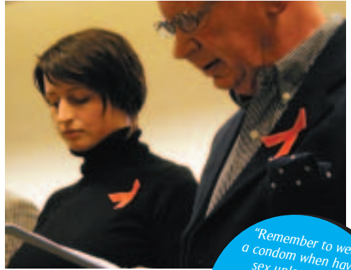
Volunteers read aloud extracts from the new book at Brighton's Jubilee Library.

Last year people from all over Sussex were asked to answer the question 'What does HIV and Aids mean to you?'